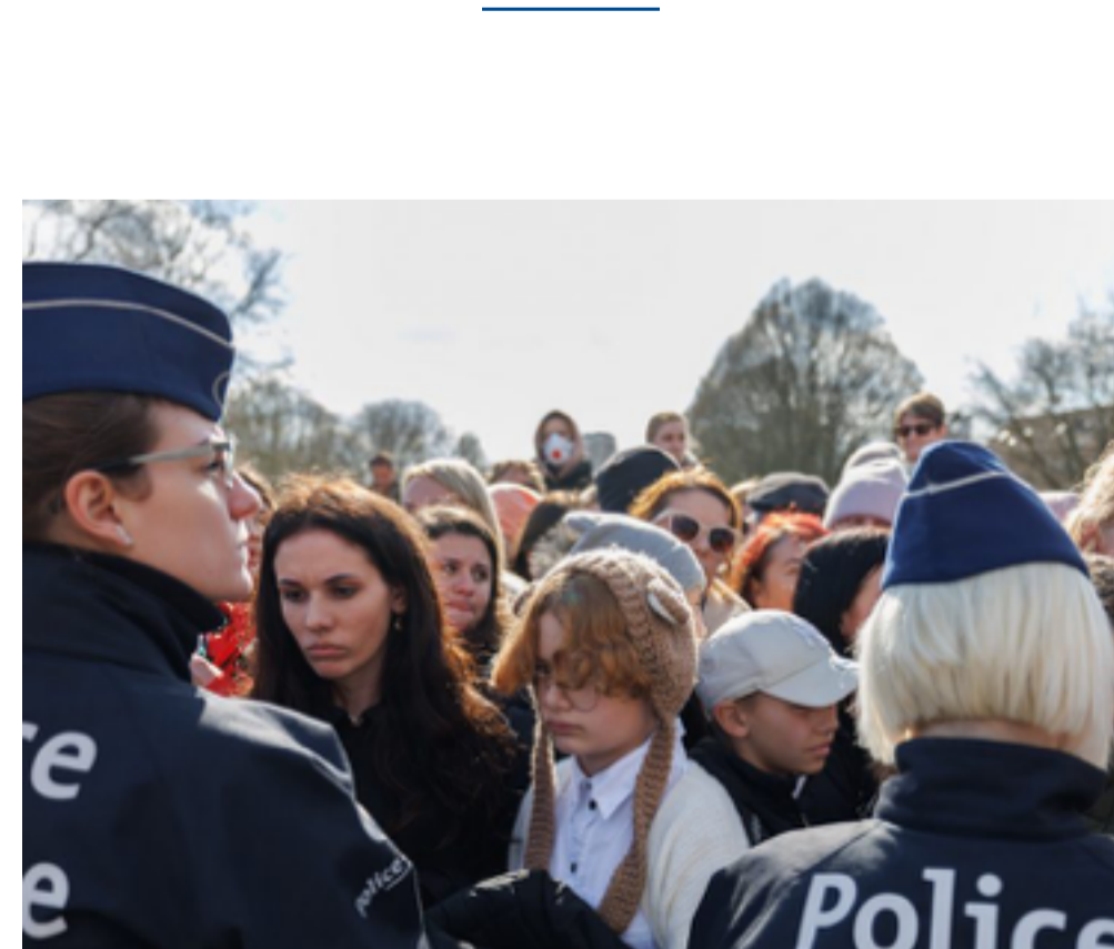
CARTES BLANCHES, RESEARCH MAR 16, 2022